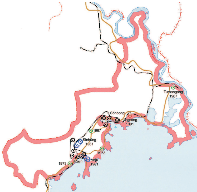
Figure Rason-I. Dong and former rodongjagu