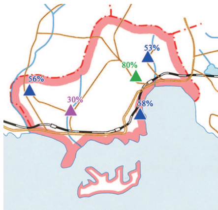
Figure Sinpho-I. Forest area in the ri

The forest covers about 60% of the area and consists partly of pine trees or oaks.